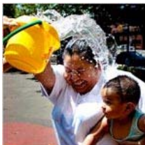
No Matter How You Cut It, a July That's Too Hot