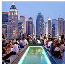
Manhattan's Rooftop Bars: Heaven's Gates