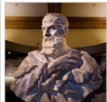
A Museum Display of Galileo Has a Saintly Feel

Home | World | U.S. | N.Y. / Region | Business | Technology | Science | Health | Sports | Opinion | Arts | Style | Travel | Jobs | Real Estate | Automobiles | Back to Top Copyright 2009 The New York Times Company | Privacy Policy | Terms of Service | Search | Corrections | RSS | First Look | Help | Contact Us | Work for Us | Site Map