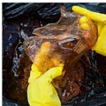
Death Does Not Deter Jellyfish Sting