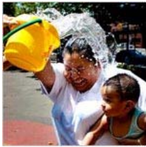
No Matter How You Cut It, a July That's Too Hot