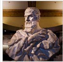
A Museum Display of Galileo Has a Saintly Feel

Home | World | U.S. | N.Y./Region | Business | Technology | Science | Health | Sports | Opinion | Arts | Style | Travel | Jobs | Real Estate | Autos | Back to Top Copyright 2010 The New York Times Company | Privacy | Terms of Service | Search | Corrections | RSS | First Look | Help | Contact Us | Work for Us | Advertise | Site Map