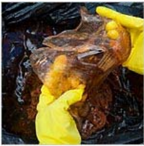
Death Does Not Deter Jellyfish Sting