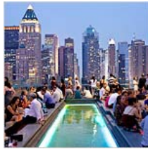
Manhattan's Rooftop Bars: Heaven's Gates